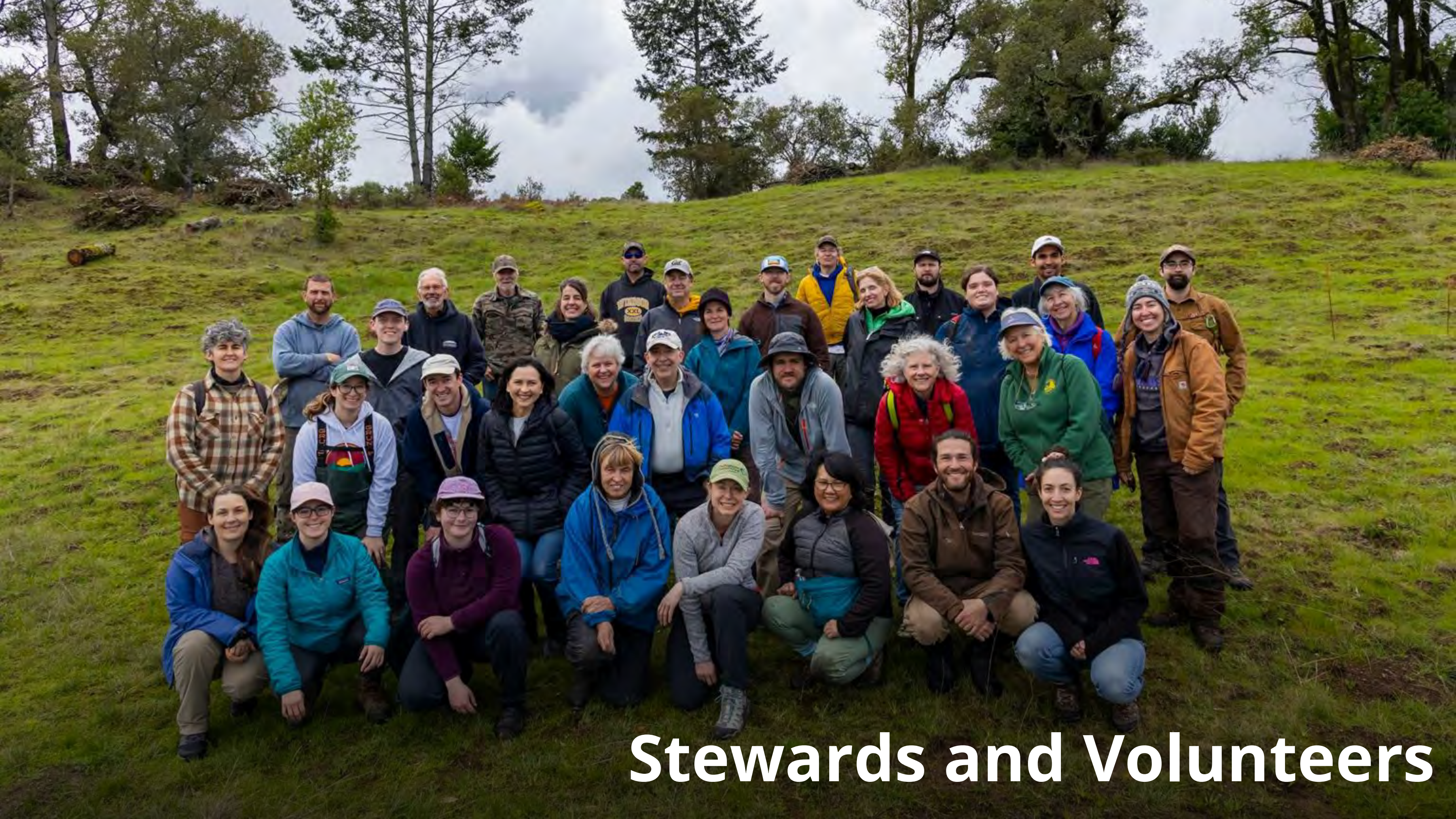
Stewards and Volunteers