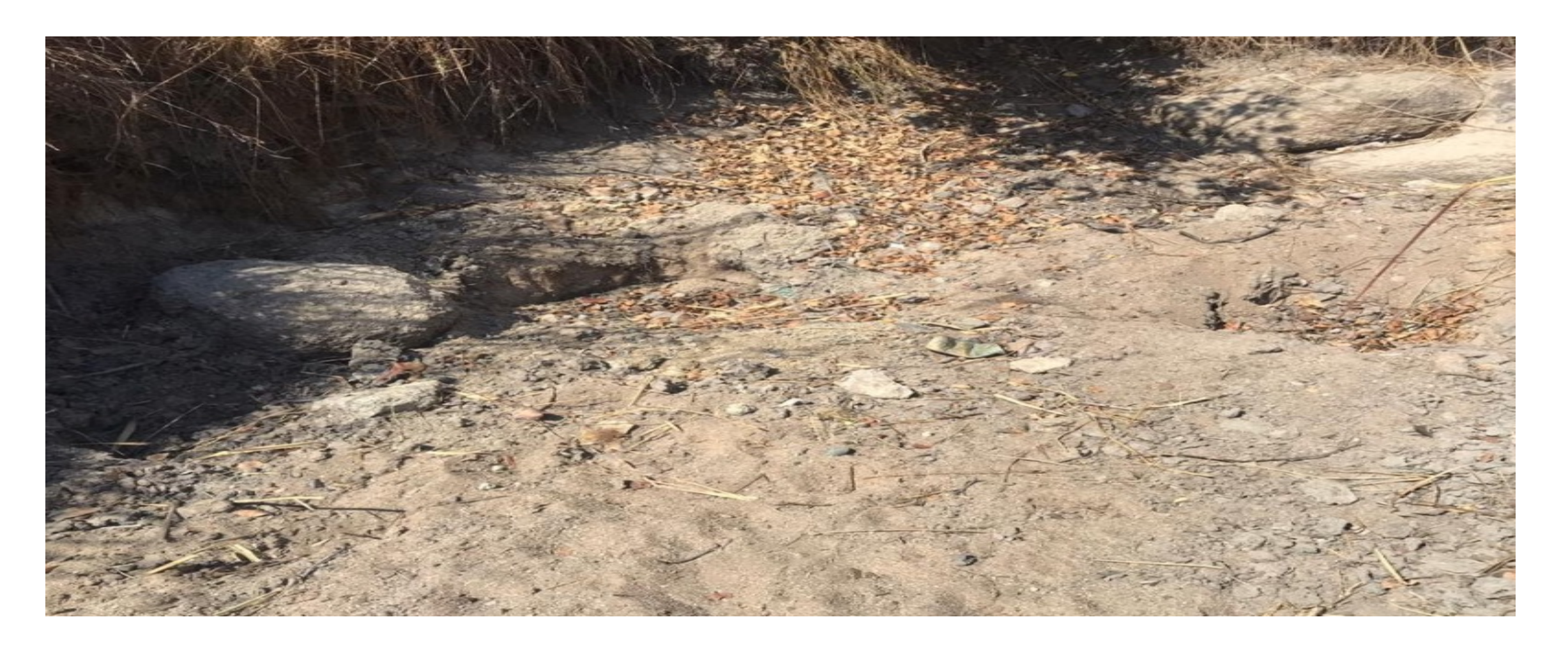
Many years of drought has resulted in a desperate need for water.