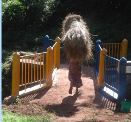
A woman crossing the bridge