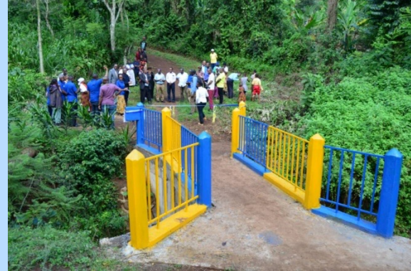
Community members waiting for the guest: Dr. Charles Kimei the Member of Parliament representing the area