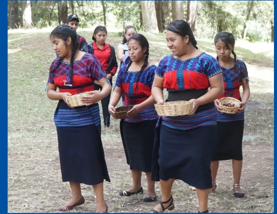
Other scholarship recipients celebrating in their traditional dresses