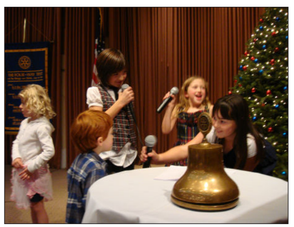
The kids had a great time around the tree

Pris Abercrombie had a knee replaced and is doing well.