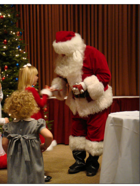
Santa was a hit with the kids

Tonight's program was to wrap presents for our annual Christmas ballet and gift-giving program. Before we got going on wrapping presents, a visit from Santa Claus pleased the youngsters in the crowd. Santa seemed to be a bit