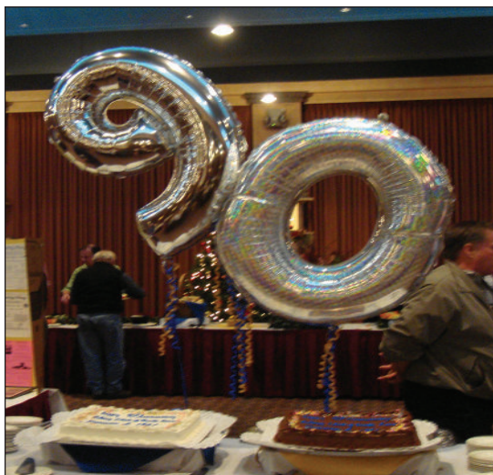
The Rotary Club of Santa Rosa is 90 years old and never looked better!

HAPPY ANNIVERSARY ROTARY CLUB OF SANTA ROSA. Thank you Rotarians for making the first 90 years a true Rotary Experience.