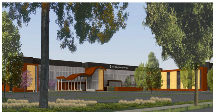
Another view of the new Sutter Hospital