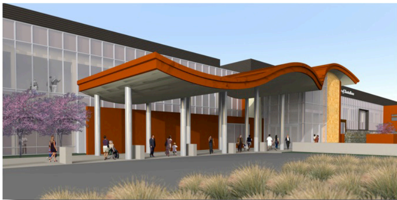
Artist's rendering of the new Sutter Hospital

FLAMINGO RESORT HOTEL, WEDNESDAY, 12:00 NOON