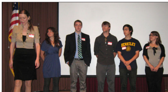
Deserving Foundation Scholarship Recipients