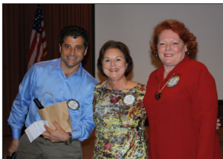
The Three April Amigos