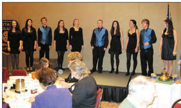
Maria Carrillo Jazz Choir

The meeting ended with the wrapping of presents for the kids going to the Nutcracker.