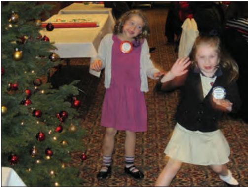
Goofy girls by the Christmas tree

Evening Meeting with Santa Rosa Rotary Clubs 5:30PM