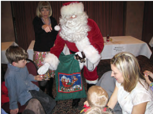
Santa was a big hit