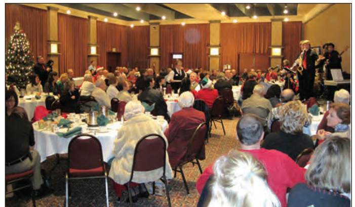
What a wonderful Rotarian Christmas party!