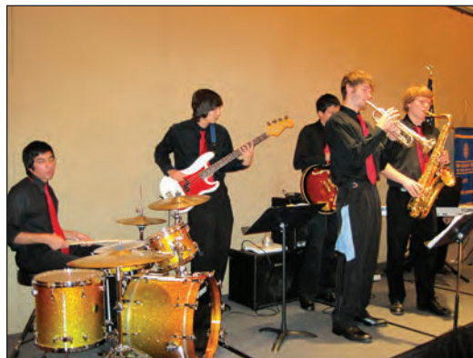
Montgomery High Jazz Combo